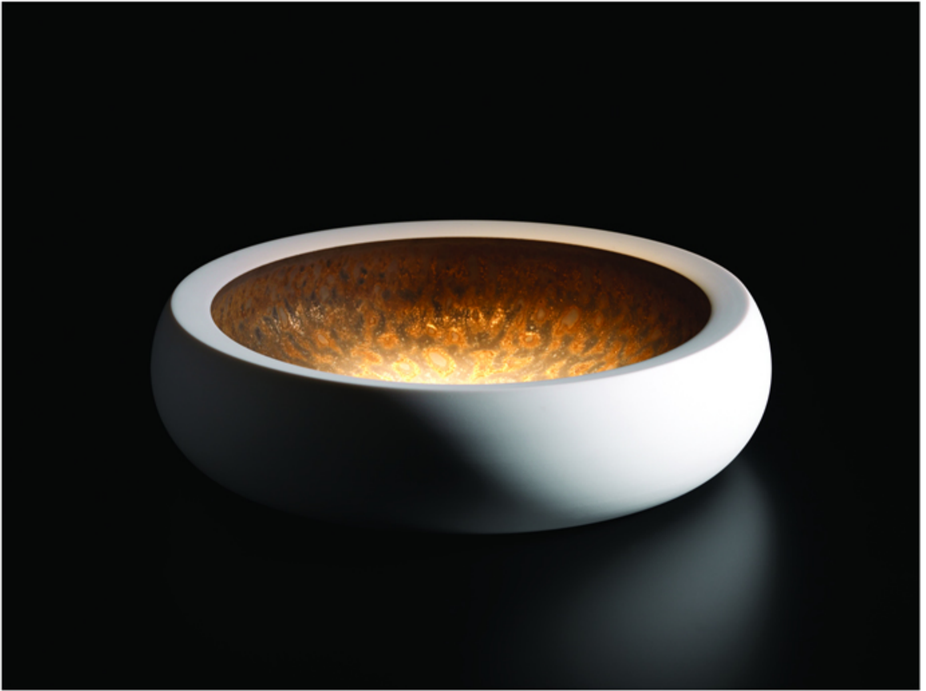
Limoges Porcelain Vessel with Bronze Glaze, 2012