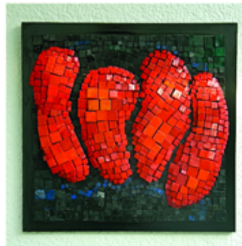
Mosaic II 6x50x50 cm, Wood, 2010