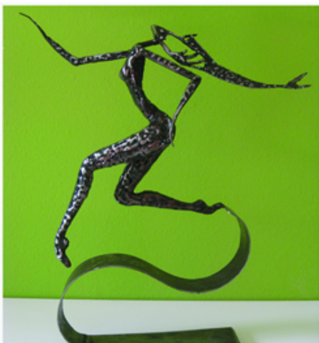
An Anchovy's Dream 40x33x17 cm, Steel, 2011