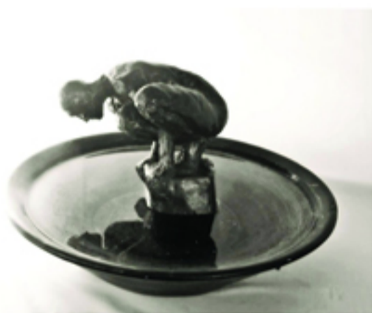
Reflection 20x10x20 cm, Bronze, 2012