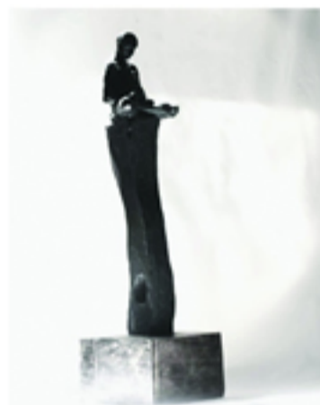
Meditation 53x10x10 cm, Bronze, 2012