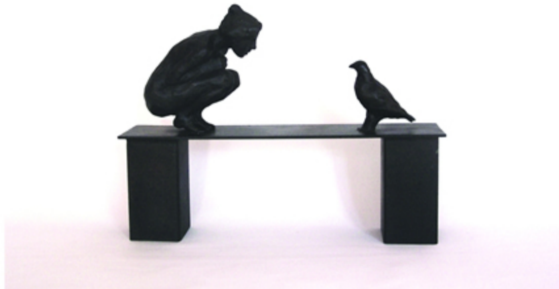
Conversations 30x17x10 cm, Wood, Bronze, 2012