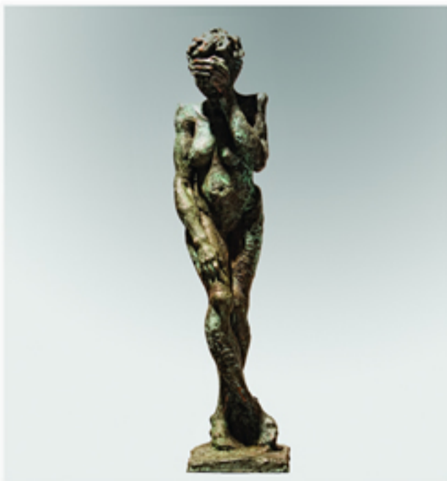
Wish I don't see 74x15x14 cm, Polyester Bronze Plated, 2012