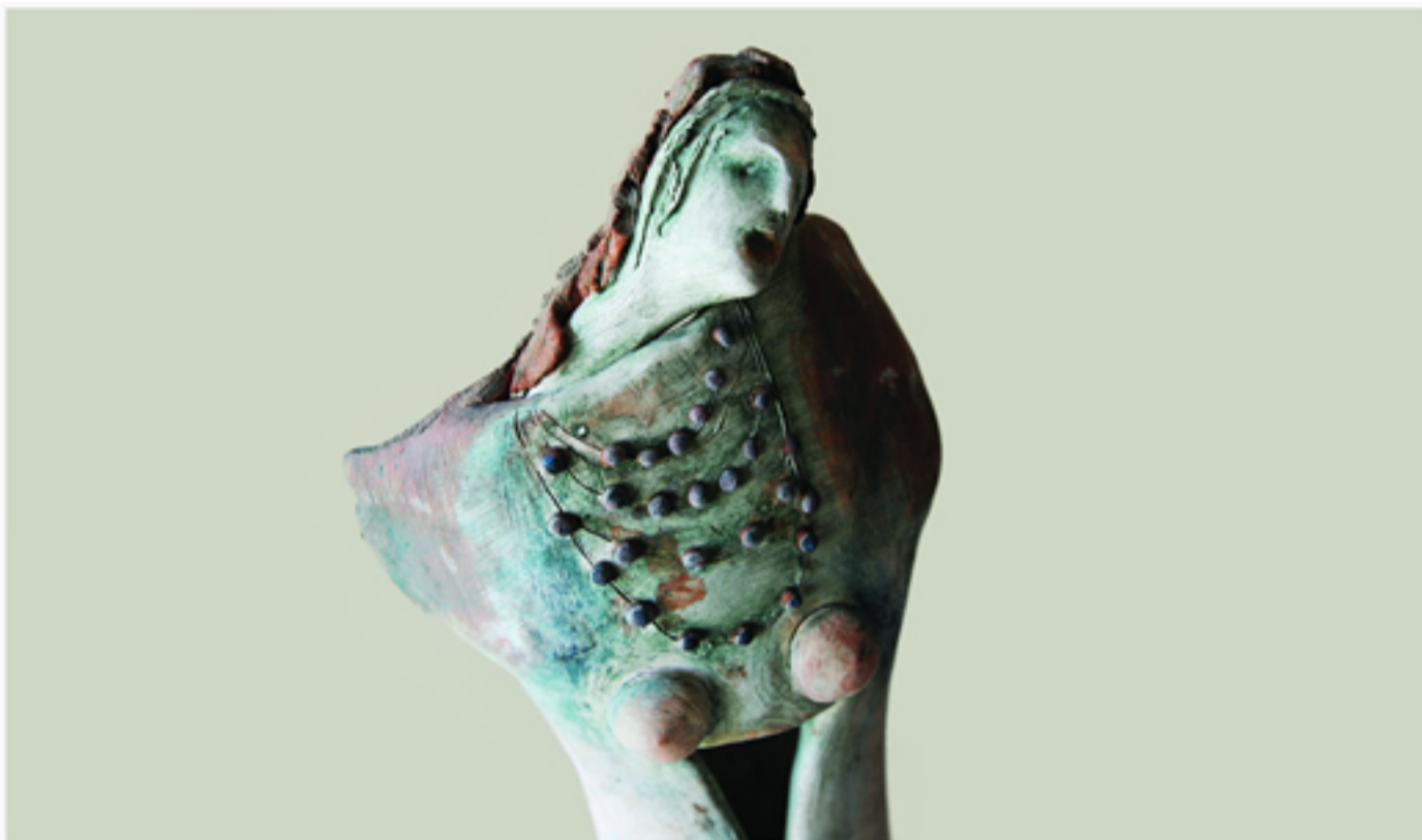
Pain of Kybele 38x15.5x15 cm, Plastic White and Red Clay, 2011