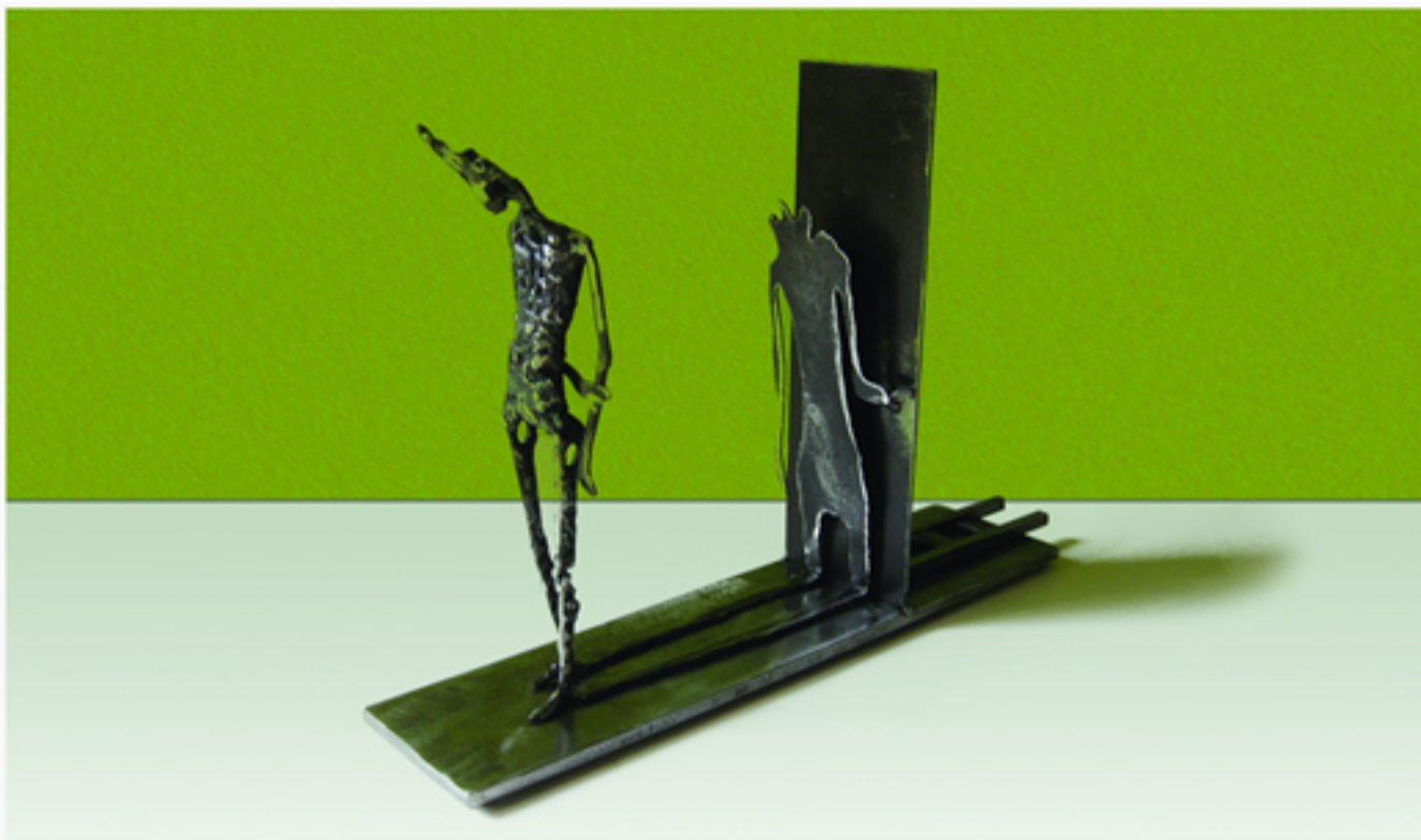
Courage of the Shadow 22x33x7 cm, Steel, 2010