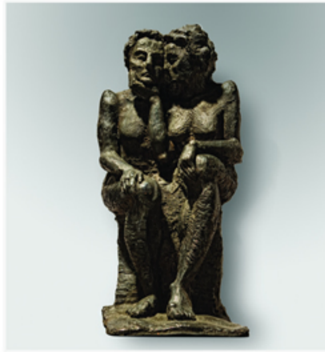
Untitled I, 64x25x29 cm, Polyester Bronze Plated, 2012