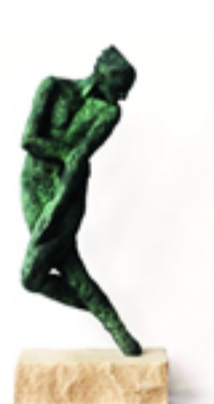
Bound with Passion 45x10x20 cm, Bronze, 2011