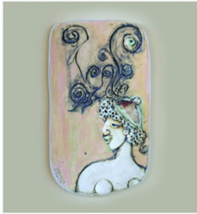
My Thoughts 23x23 cm, White Plastic Clay, 2009