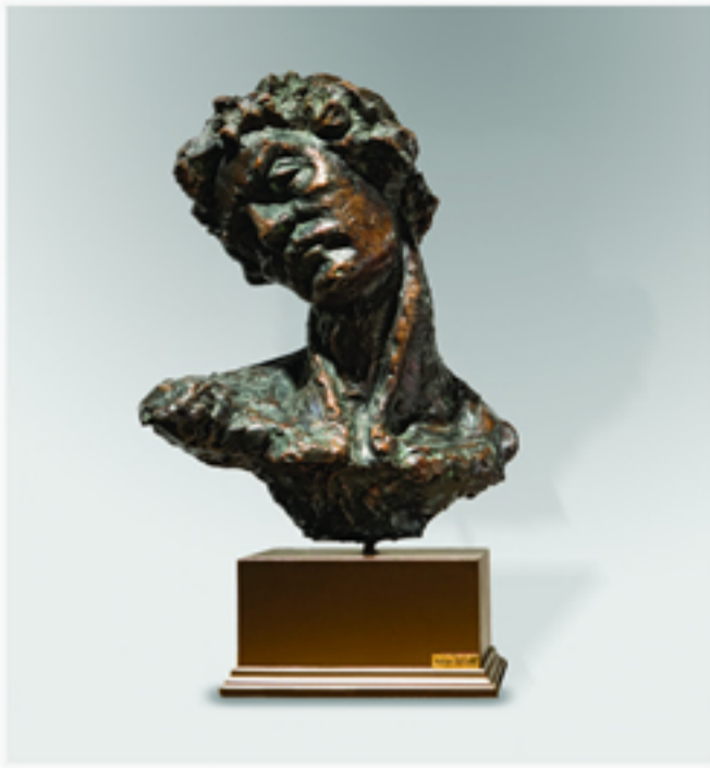
Grief 47x28x19 cm, Polyester Bronze Plated, 2011