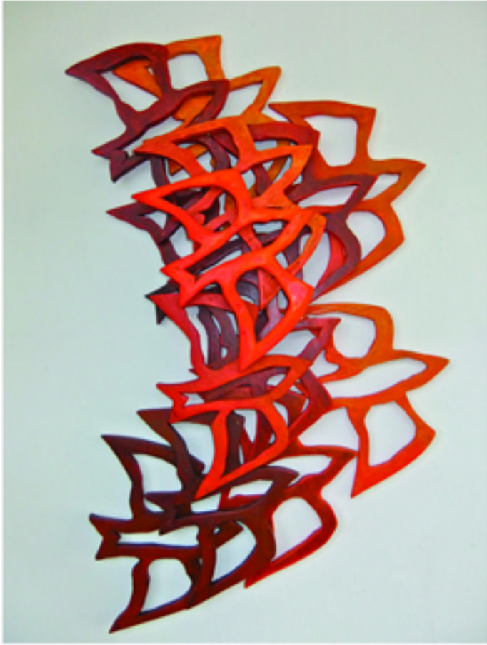
Birds by Sunset 5x38x62 cm, Wood, 2010