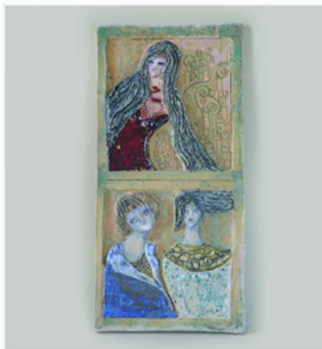
Human States 16x32.5 cm, Beauty in Red Two Friends, Fireclay, 2010