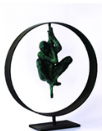
Depths of Mind 35x7x30 cm, Bronze, 2011