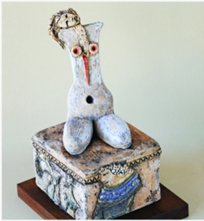
Pandora 27x19x16 cm, Fireclay, 2012