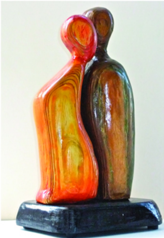
Together 22x17x32 cm, Wood, 2010