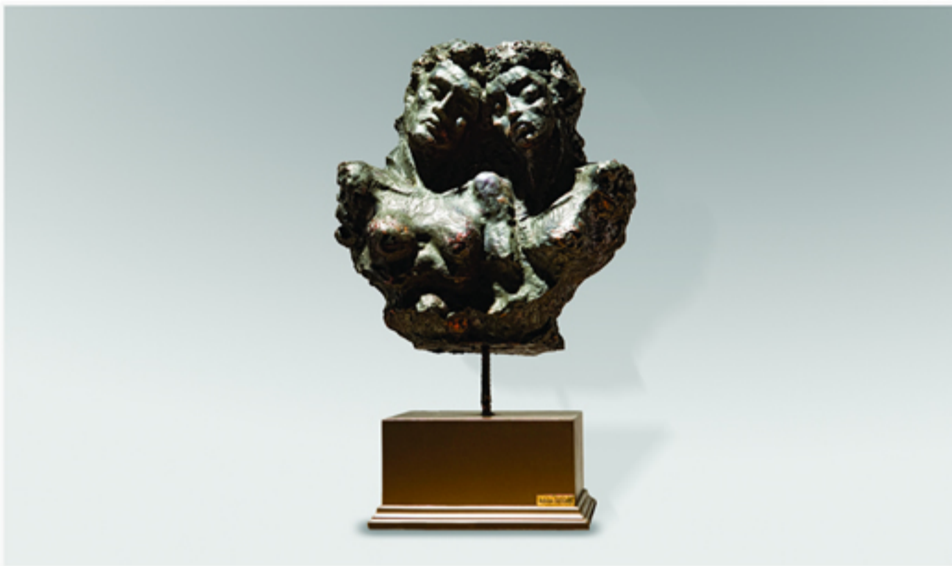
There was always love 46x28x18 cm, Polyester Bronze Plated, 2010