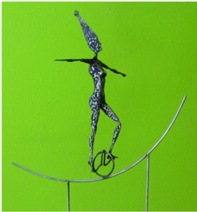
The Thin Line 157x53x33 cm, Steel, 2010