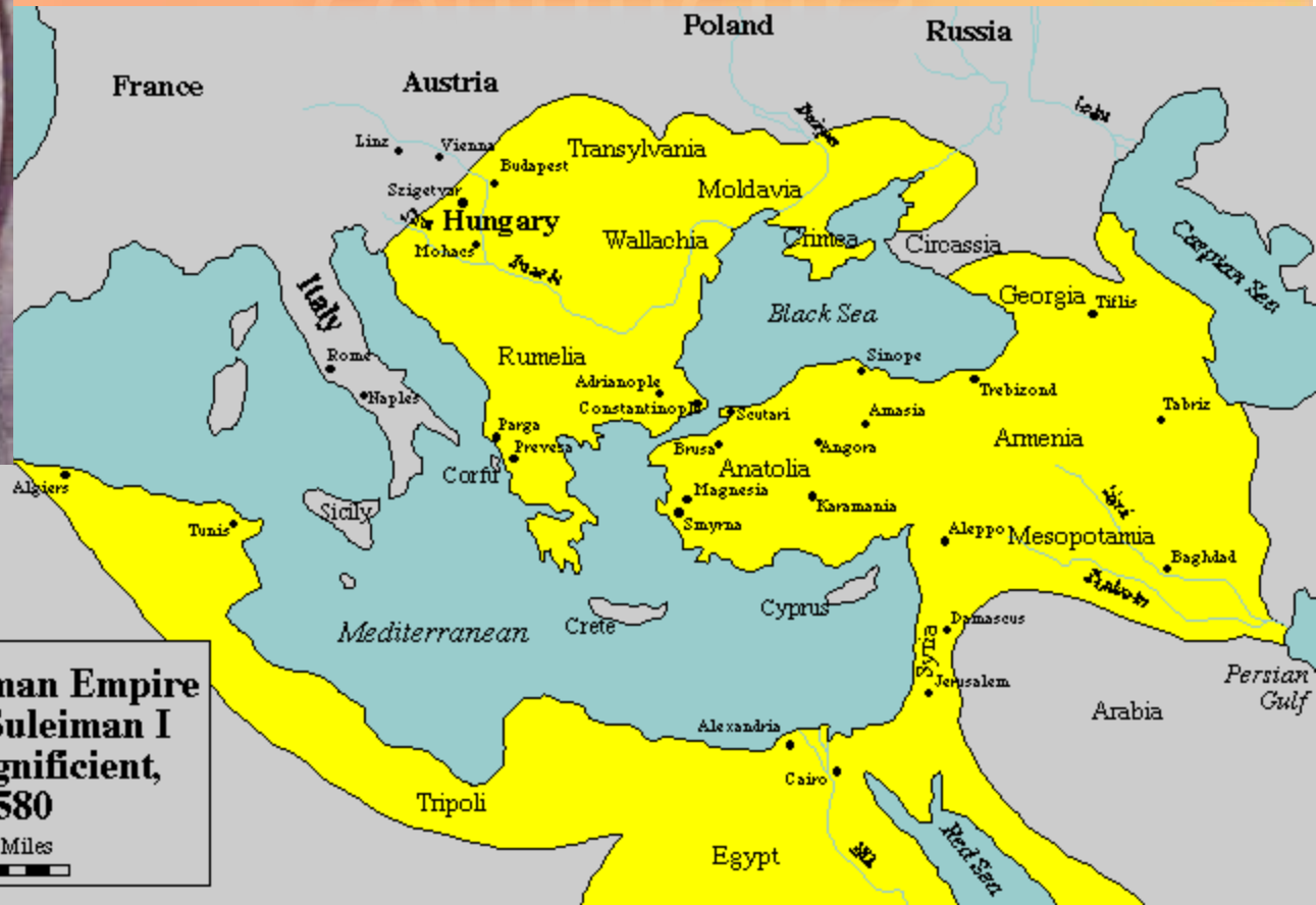
The Ottoman Empire Under Suleiman I the Magnificent, 1580